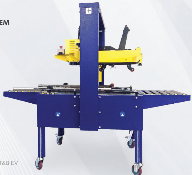
NASTROPACK T&B EV