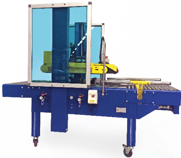
NASTROPACK NP 03 EV