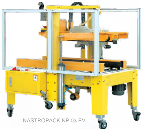
NASTROPACK NP 03 EV