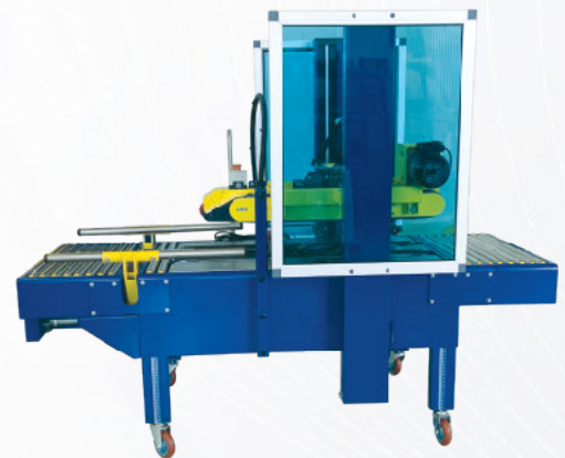
also available NASTROPACK NP 03 TB EV

Side safety panels in transparent execution, protecting the area close to the movement of the upper sealing and driving unit