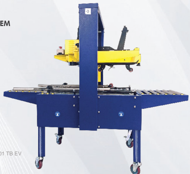
NASTROPACK NP 01 TB EV

Blue color (main structure of the machine) and yellow (moving parts)