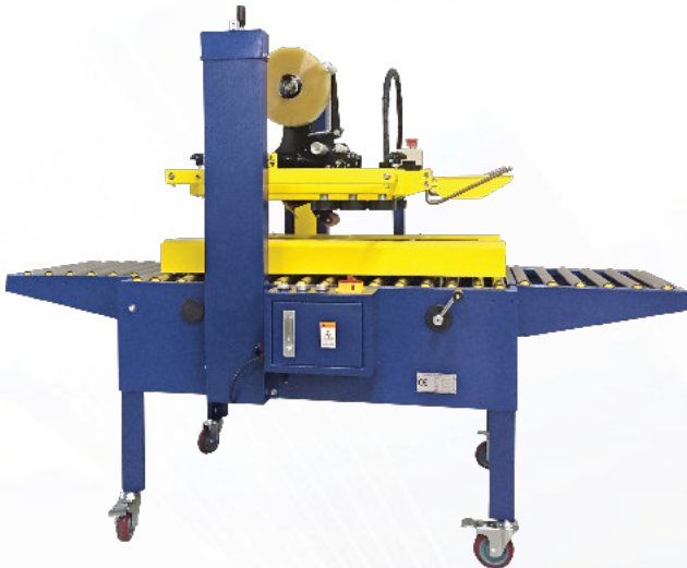
NASTROPACK NP 01 LC EV

A machine for the automatic sealing of standard-size carton boxes (units with fixed height and width). Two simple and fast manual hand-wheel adjustments allow the setting of the machine to the required box size. The bottom and the top flaps are simultaneously sealed (the carton box must be introduced in the machine with the top flaps already closed). Ideal solution for carton boxes with a maximum 50 cm width and height.