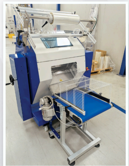
* Motorized conveyor belt (optional)