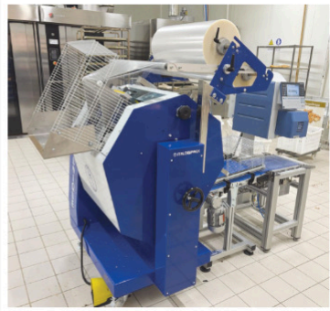
PERFECT SYNERGY between the UNIQUE Flowpack machine and the labeling/weighing-price-checking system.

The exclusive features are making Unique ideal for an endless number of applications for the agri-food packing in particular: